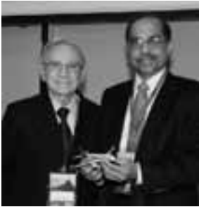
2010 Fellows' International Executive of the Year Award Ozires Silva