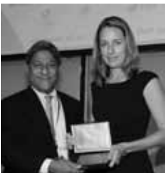
2010 Temple/AIB Best Paper Award Sponsored by Temple University's Fox School of Business